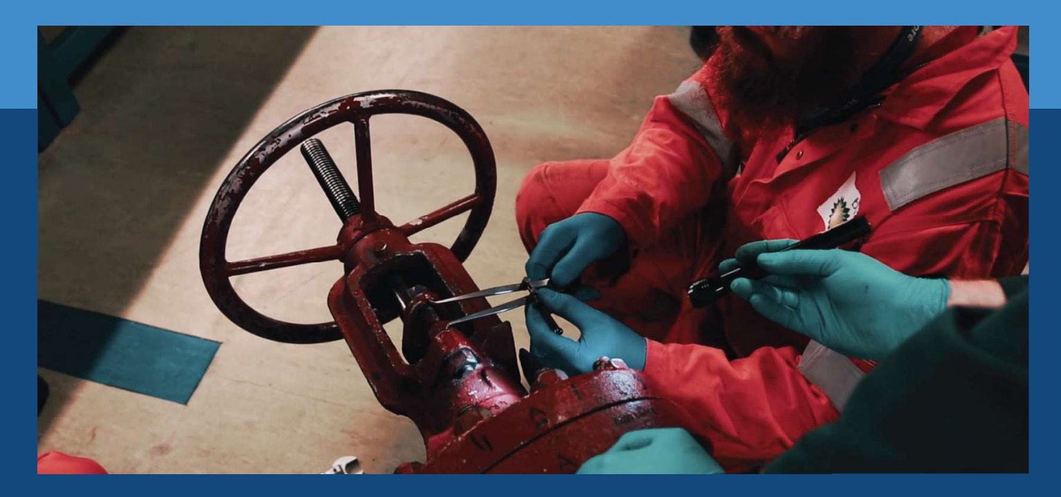
"Good course with some good technical information. Great to have practical element at the end. Trainer was excellent."

Our one day comprehensive training course has been designed for those performing compression packing duties to learn new techniques and freshen up their knowledge. You'll gain a sound understanding of the function of compression packing, and through classroom and workshop sessions you'll leave confident on the process of removal, inspection and installation of different packing types.